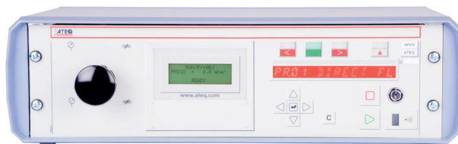
MF520 19"3U CASE