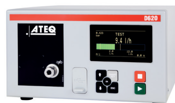
D620 Flow tester