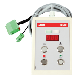
TLC 60 Remote control