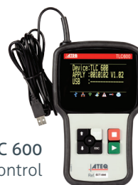
TLC 600 Remote control