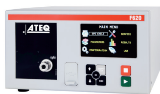
F620 leak tester